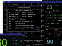
12 leads ECG analysis