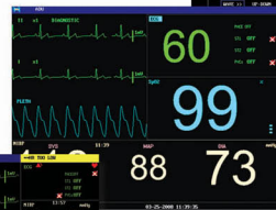
Large font display