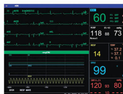
OxyCRG for Neonatal Monitoring