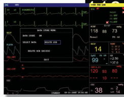
USB data storage and review