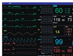
Trend Screen Mode